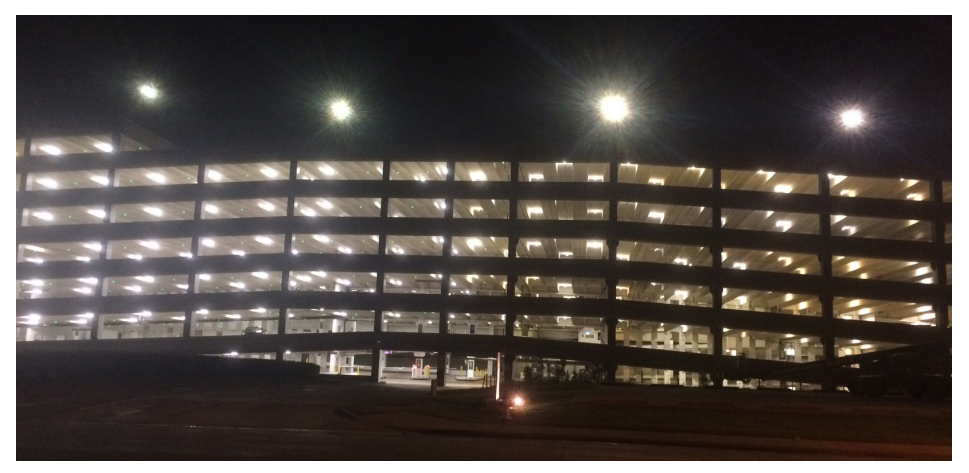
Retrofitted garage on left. Previous lighting system on right

With tenants happy with the new brightness and efficiency of the garage, the decrease in wattage and the number of fixtures fixtures left upper management happy, too, as McBryde and CBRE achieved 14-month payback on the project. Regency coordinated all of the installation labor for the more than 2,100 LED vapor tight fixtures and 15 high output LED pole fixtures for the top deck. It also handled recycling of all the fluorescents previously lighting the garage.